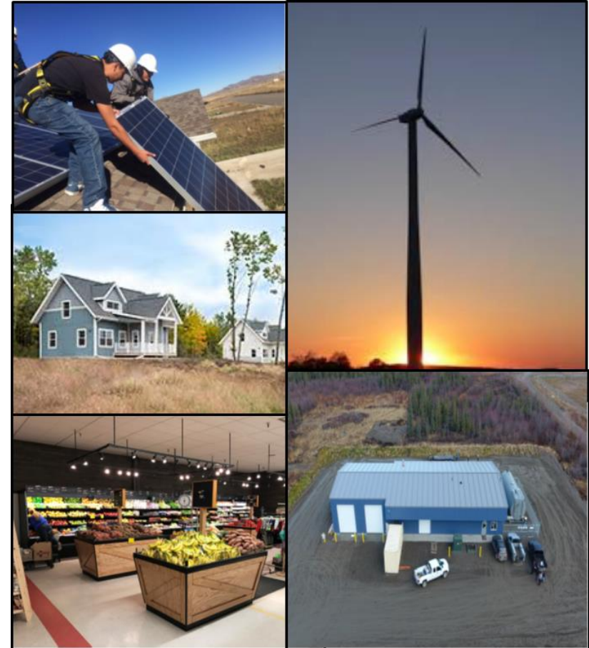
Clockwise from top right: Seneca Nation's (NY) 1.5 MW wind turbine, Fort Yukon's (AK) combined heat and powerhouse, Coeur d'Alene Tribe's (ID) Benewah Market energy efficiency project, Sokaogon Chippewa Community (WI) Housing Project, and Chippewa Cree Tribe's (MT) Residential Solar.